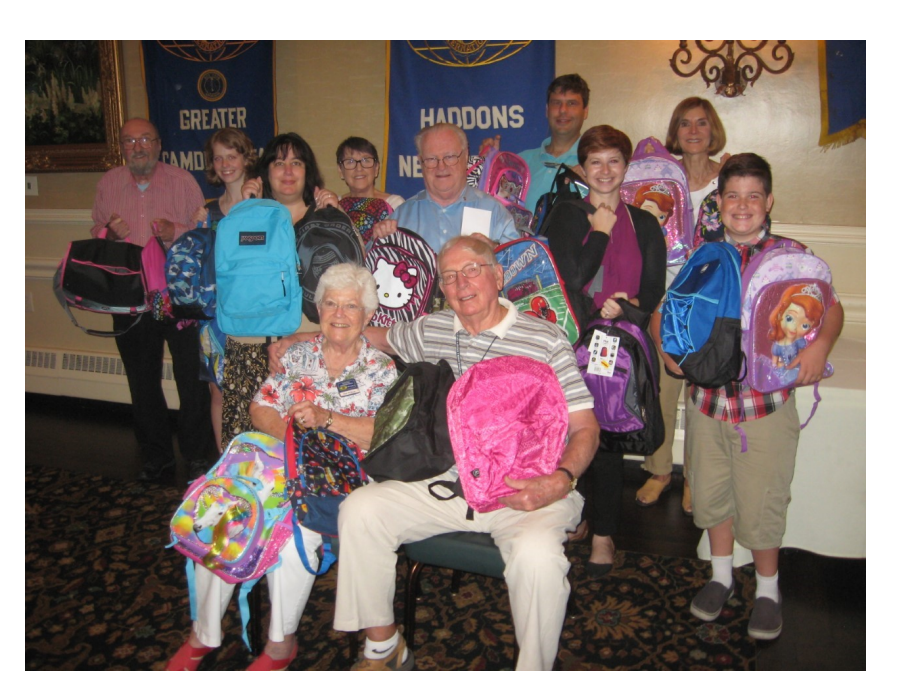
Displaying the largesse of backpacks with school supplies, the Haddons Club reports that Operation Backpack was a great success.